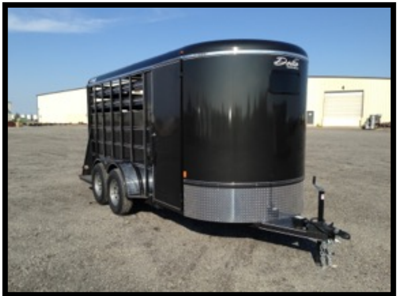
Trailer shown with optional 7" Tall height